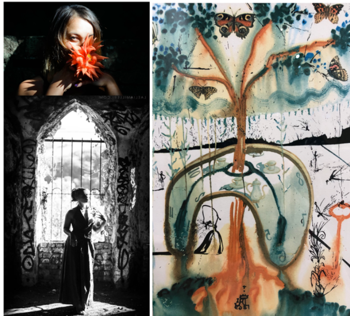
Figure 2. Poster of Alice Dali AR for FENS Neuroscience Forum staging in Paris

In Dali's paintings/illustrations, Alice is always present – a small figure silhouetted in black with a skipping rope and a shadow. This connecting element, in the musical cycle, is a waltz 3/4, symbolising Alice, with spontaneous passages and interrupted phrases as a "childlike" speech.