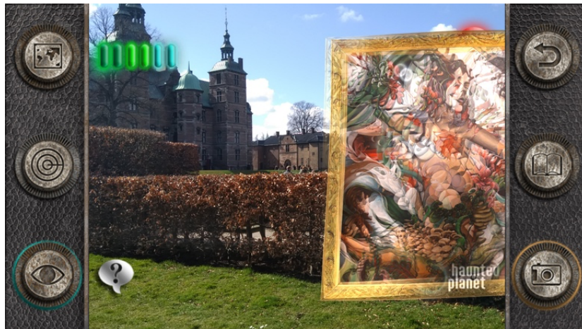
Figure 1. Playing Synaesthesia Gallery AR in the park